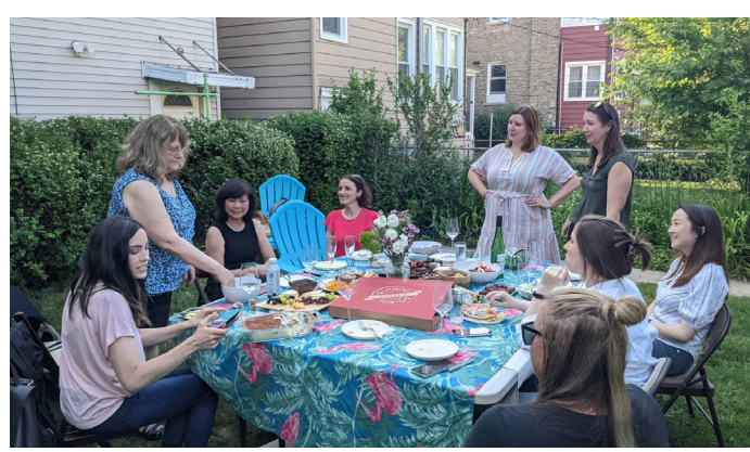
The first in-person UChicago Global team gathering in Chicago in summer 2021