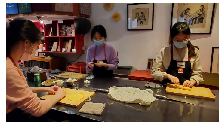
The cohort of undergraduate students in Beijing participated in a variety of activities, including this cooking class with a Mexican chef.