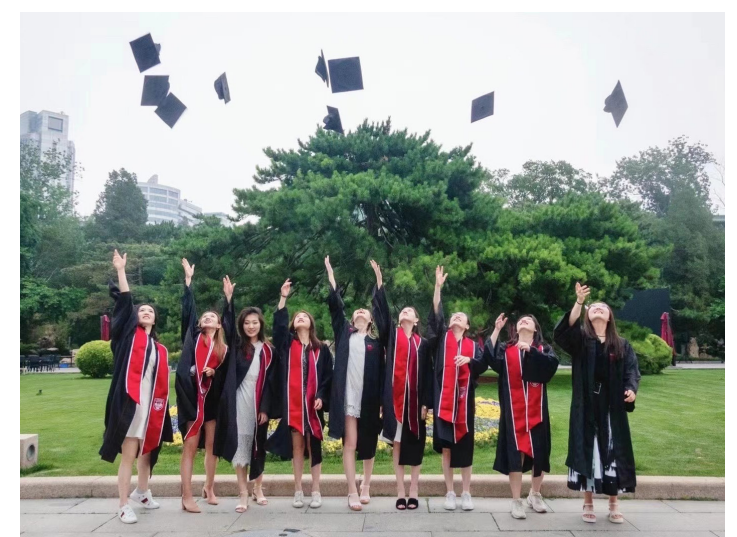
Graduating College students celebrate Convocation at the Center in Beijing