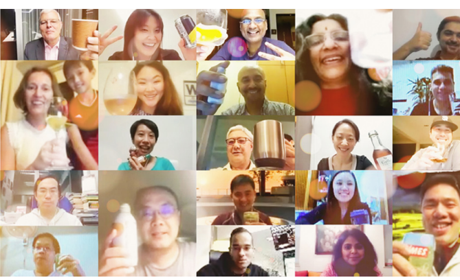
UChicago alumni across Asia share a toast at the Yuen Campus-hosted Alumni Cloud Happy Hour

The Center in Beijing helped connect parents all over China to parent leaders who were organizing a chartered flight to the US for fall quarter.