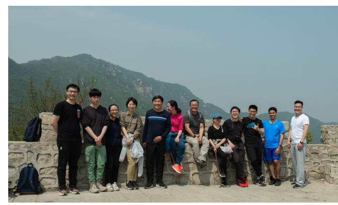
A Center in Beijing staff outing in spring 2021